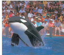
●Kamogawa Sea World (Kamogawa City)

2-3-9, Kazusakamatari, Kisarazu-city, Chiba, 292-0818, Japan Conference, Event, Exhibition etc.