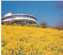
●Kano-zan Mother Farm (Futtsu City)