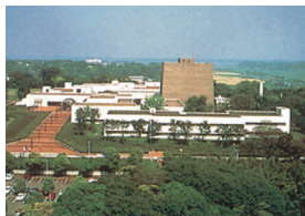
●National Museum of Japanese History (Sakura City)