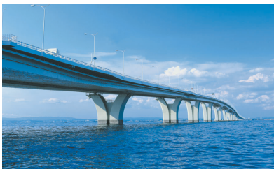
●Tokyo Wan Aqua-Line