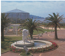
●Nanbo Paradise (Tateyama City)